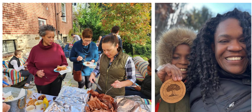
Just a few events made possible by your generous support to ONA. Pay your dues today!

Make sure to indicate your full Original Northwood address in your Venmo transfer or on your check, so that we can register your payment correctly. Thank you for supporting YOUR Neighborhood Association!